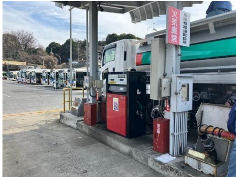
Fuel delivery at Sotetsu Bus's Asahi Bus Depot