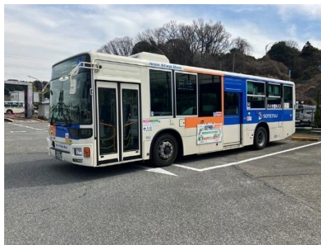
Bus that runs on Cosmo CF-5