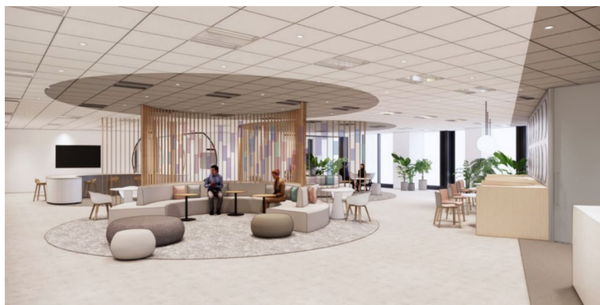
Guest reception area

desk model, employees can choose from various seating options based on their respective tasks and goals. This approach seeks to foster self-directed growth, further enhance communication, and drive innovation.