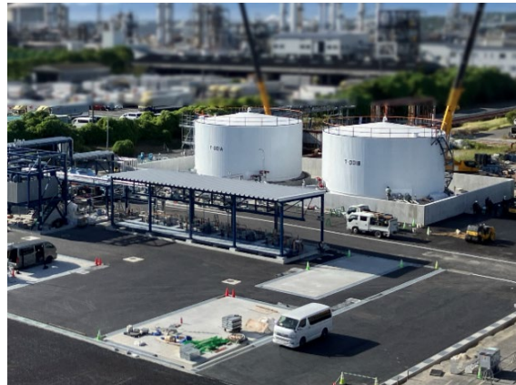
Facility for receiving used cooking oil as feedstock for SAF (on the premises of Cosmo Oil's Sakai Refinery)