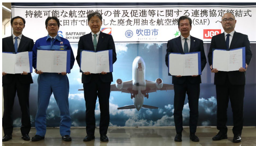
Photo of the agreement signing ceremony

Under the Agreement, Suita City is expected to provide approximately 27,000 liters of used cooking oil per year as feedstock for SAF, marking the largest volume of used oil repurposed as SAF feedstock by a local government in Japan.