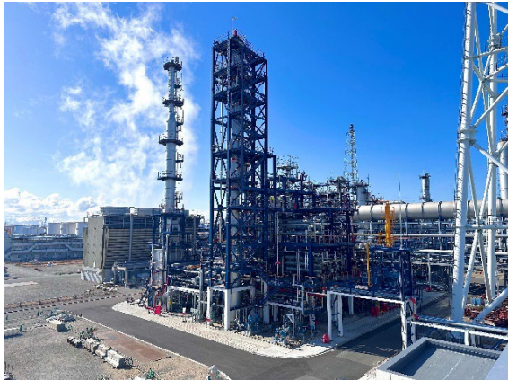
The completed SAF plant (on the premises of Cosmo Oil's Sakai Refinery)