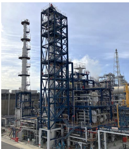
SAF production facility (photo taken in December 2024)